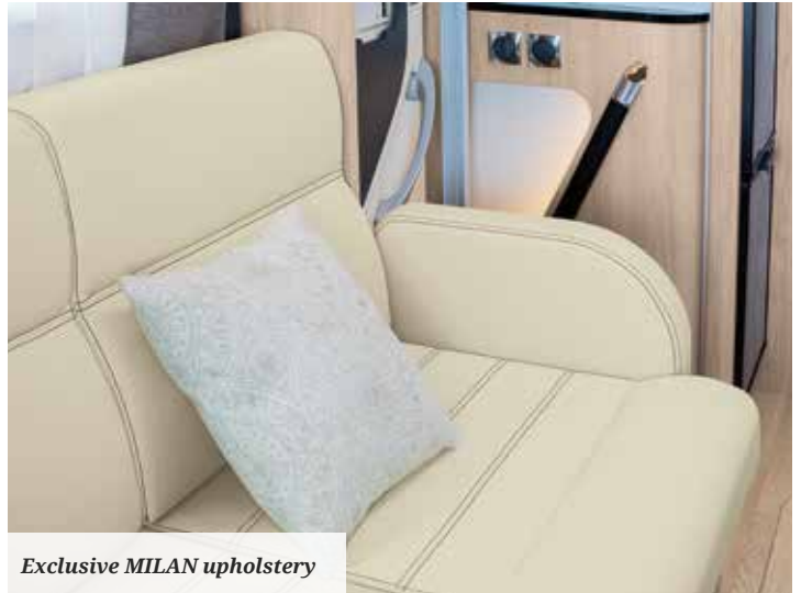
Exclusive MILAN upholstery