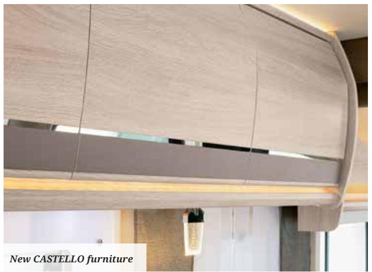
New CASTELLO furniture